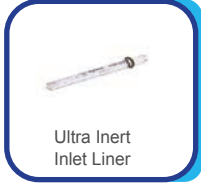
Ultra Inert Inlet Liner