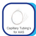
Capillary Tubing's for AAS