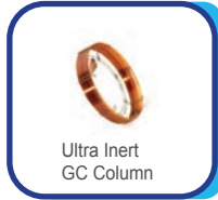
Ultra Inert GC Column