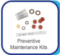
Preventive Maintenance Kits