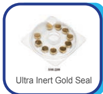
Ultra Inert Gold Seal