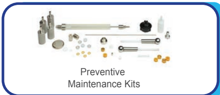
Preventive Maintenance Kits