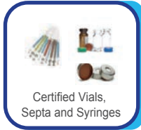
Certified Vials, Septa and Syringes